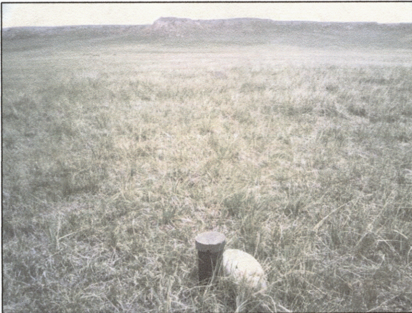
Date of Field Work: 5/9/2014