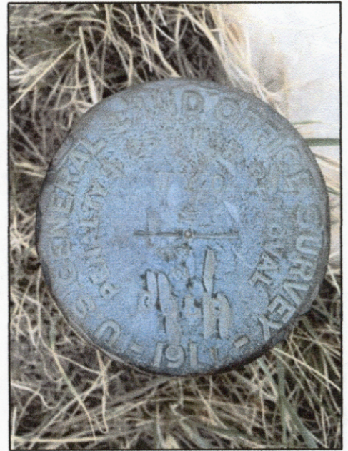
Project Point No.: 100532